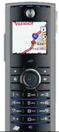
Motorola iDen i425